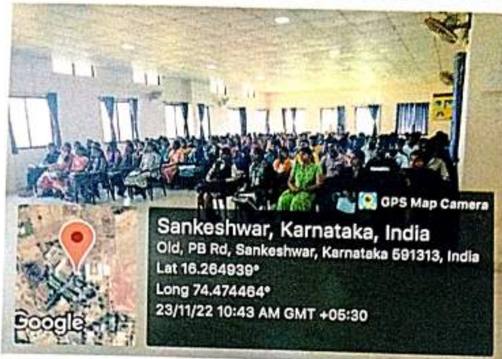
STUDENTS PARTICIPATION IN THE CAREER GUIDANCE PROGRAM